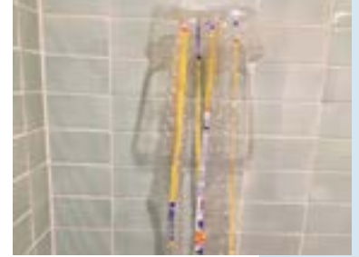
Maureen and Bill Strauss won Most Creative Use of Materials