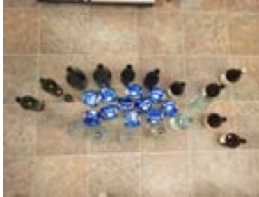
Skyler Golt won Most Unique Sea Creature and Most Creative Name and Description