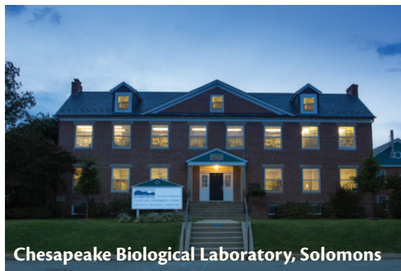
Chesapeake Biological Laboratory, Solomons