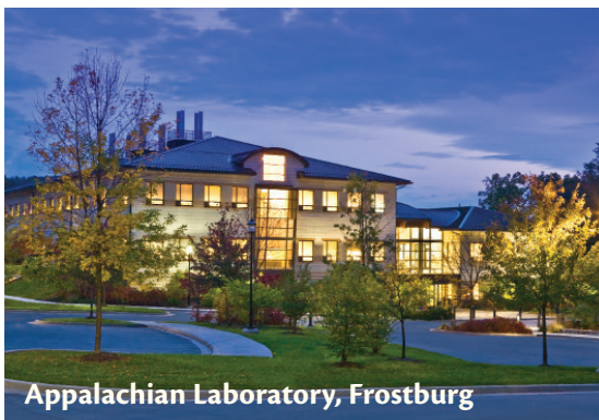
Appalachian Laboratory, Frostburg

UMCES is unique in its comprehensive mission to develop and apply “a predictive ecology” for Maryland through scientific discovery, integration, application, and education. The Center is also renowned internationally for the impact of its science.