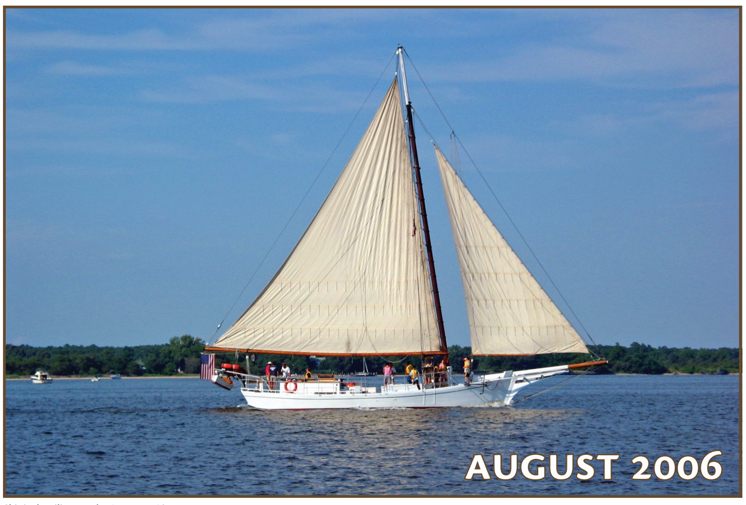
Skipjack sailing on the Patuxent River.