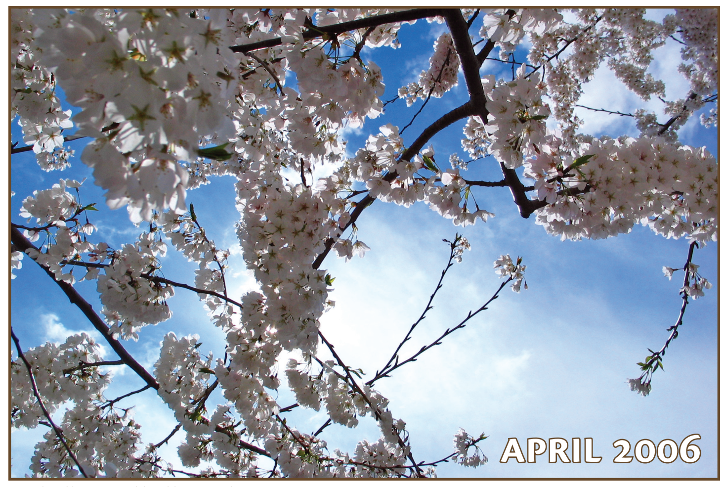
Spring cherry blossoms around the Tidal Basin in Washington D.C