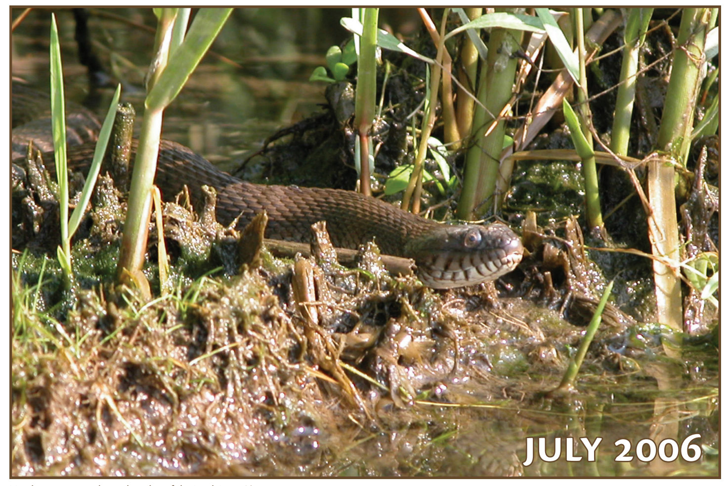
Northern water snake at the edge of the Tred Avon River, Easton.