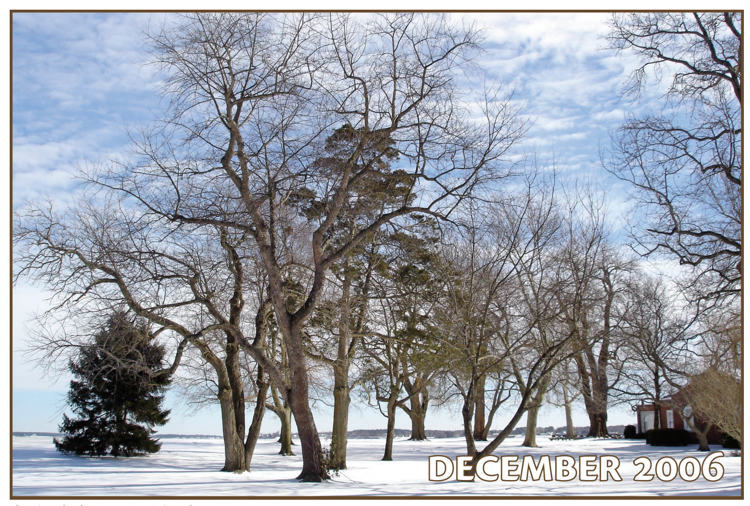
The winter landscape at Horn Point Laboratory.