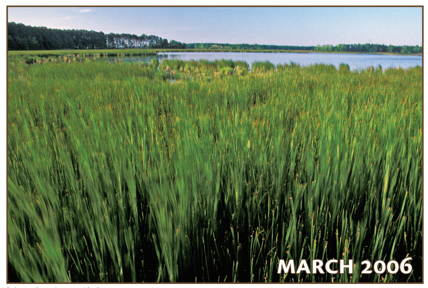
Spring marsh near Assateague Island.