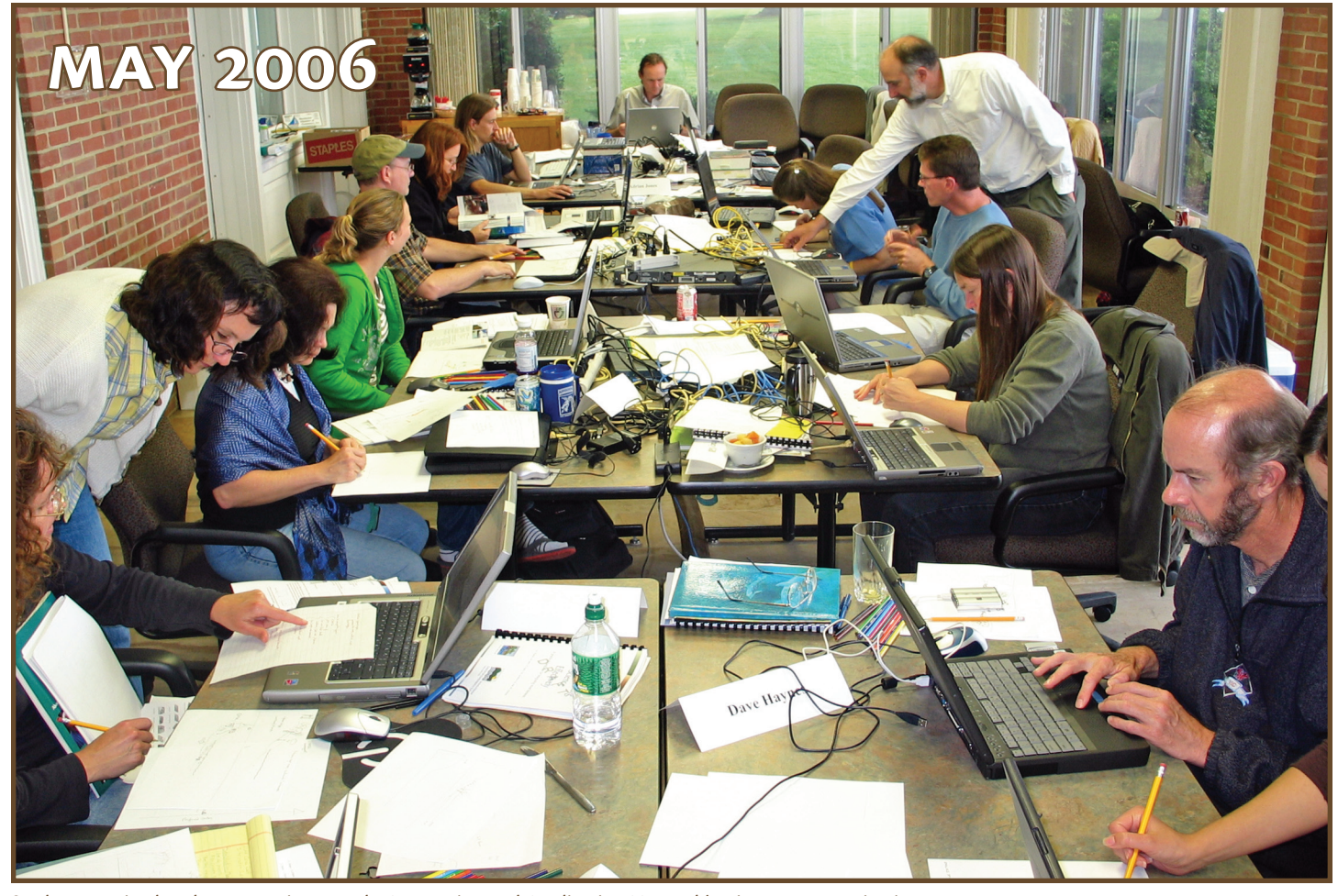
Students getting hands-on experience at the Integration and Application Network's science communication course.