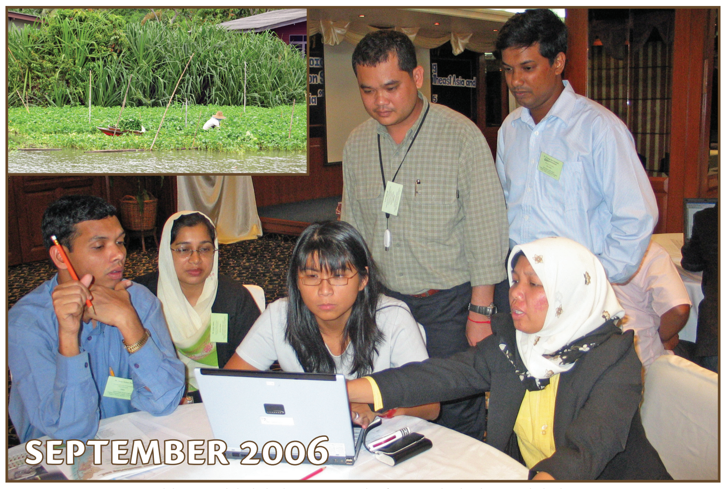
Main: Science communication workshop in Bangkok, Thailand. Inset: Morning glory farming on the Tha Chin River, Thailand.