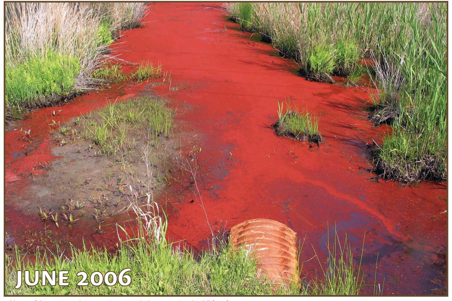
A bloom of the protist Euglena sanguinea near Blackwater National Wildlife Refuge.