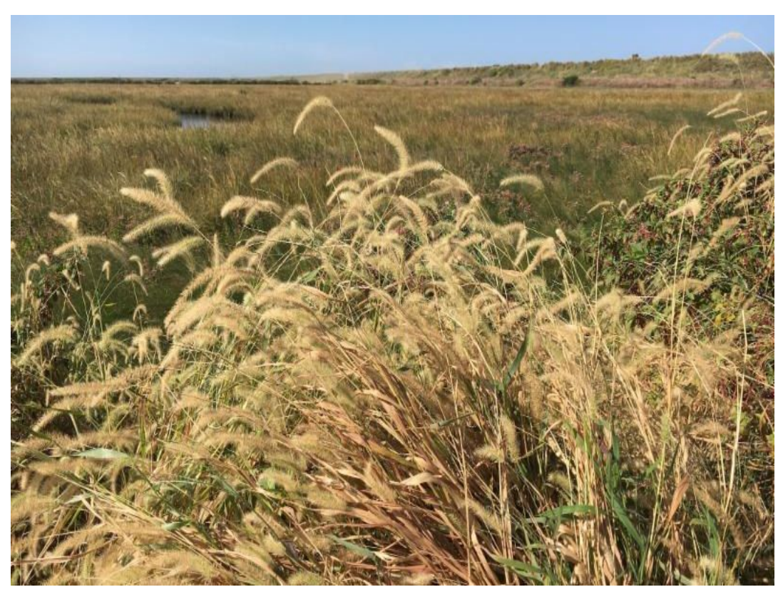
Restoring Wetlands: A closer look at Poplar Island

Wetlands are important for housing unique plants and animals, absorbing carbon, improving water quality, and protecting coastlines. Lorie Staver is monitoring marshes in an effort to restore Poplar Island's habitat. She talks about the the project during a tour of the island.