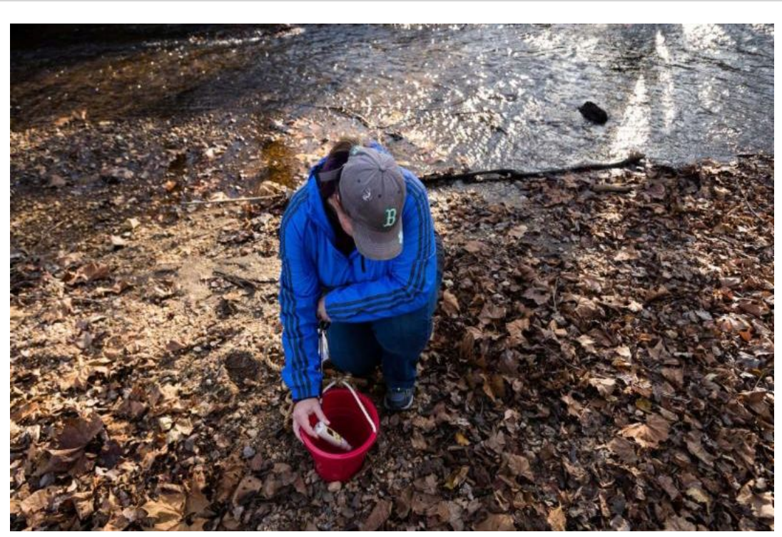
New website provides free resources for citizen scientists

effects on people and the ecosystem. It is important to have tools to understand where wastewater and the chemicals from wastewater end up and to understand the composition of wastewater to be able to treat it." MORE