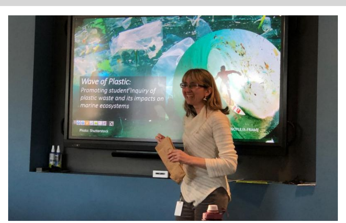
'Wave of Plastic' partnership brings watershed education to Southern Maryland middle schools

The Chesapeake Biological Laboratory received funding from the National Oceanic and Atmospheric Administration Bay Watershed Education and Training program to support "Wave of Plastic," an education partnership that will help Southern Maryland students understand the connections between