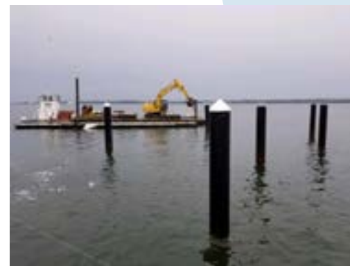
Beginnings of the floating pier repair!