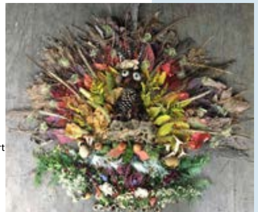
Suzi Spitzer's Forage Art Challenge Entry