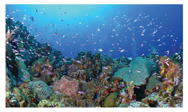
A reef scene at Desecheo Island Marine Reserve.

People living in Puerto Rico have a diversity of livelihoods and experiences, which depend on the benefits provided by healthy coral reef systems. The beaches and coral reefs of the offshore islands, including Culebra, Vieques, Caja de Muertos, Mona, and Desecheo, attract divers, snorkelers, and boaters from around the world. Marine tourism generates an important source of employment and income for dive operators, tour boats, marinas, fishing charters, and the service industry, all of which support the regional economy. White sands in areas such as Flamenco Beach in Culebra are made of fine grain sands produced by sea urchins and parrotfishes that graze on the algae of coral reefs.