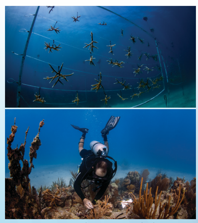
A submerged nursery of growing corals (top). A diver assesses recently planted corals (bottom).

On their own, reef-forming corals grow slowly. That's why in 2000, graduate students from the University of Puerto Rico received funding from the Sea Grant College Program to accelerate reef restoration using coral fragmentation. Living coral segments, fragmented from one individual, are capable of taking root and regenerating in the wild. The first project consisted of fragmenting staghorn corals (Acropora cervicornis) and transplanting segments to various reefs within La Parguera Natural Reserve. This approach to reef restoration has expanded into a network of coral nurseries in Puerto Rico, where dedicated teams cultivate juvenile corals before planting them on a reef. The nurseries are operated by public agencies, private enterprises, and nongovernmental organizations. So far, over 100,000 farmed corals have been planted to increase coral populations on Puerto Rico's reefs. Because juvenile mortality for farmed corals has been low in the wild, coral nurseries have helped reefs recover more quickly from both human impacts and natural disasters. This restoration also helps preserve the ecological services that coral reefs provide to Puerto Rico.