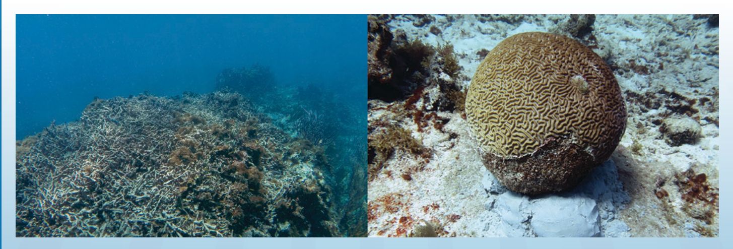
Scattered corals broken by 2017 hurricanes (left). A coral colony is reattached to the reef with cement (right).

The same reefs that protect the coast during a hurricane are also subject to storm damage themselves. In 2017, Hurricane Maria struck Puerto Rico's coral reefs with devastating force. After the storm passed, two teams of National Oceanic and Atmospheric Administration (NOAA) scientists and local partners went out to the reefs—one team to assess reef damage, and another to re-attach broken coral colonies. This effort focused on reefs that bore the greatest brunt of the storm. From February to June 2018, the teams surveyed over 86,000 corals