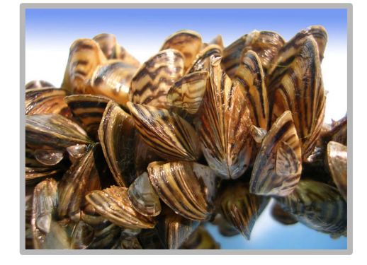
Zebra Mussels (Dreissena polymorpha)