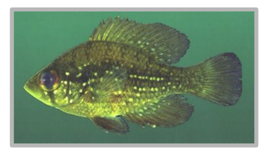
Bluespotted Sunfish (Enneacanthus gloriosus)