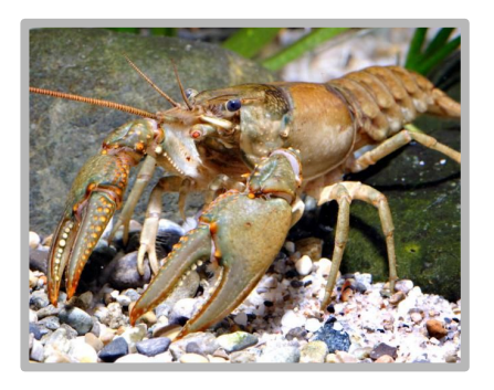
Virile Crayfish (Orconectes virilis)