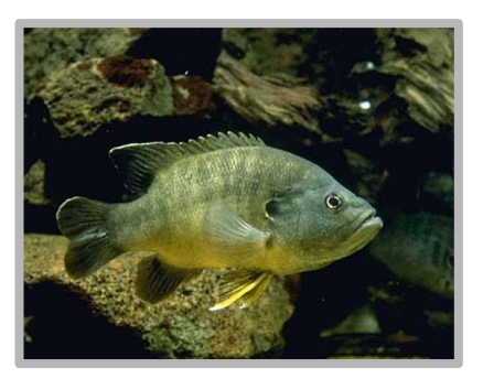
Green Sunfish (Lepomis cyanellus)

Blue and Flathead Catfish (Ictalurus furcatus & Pylodictis olivaris)