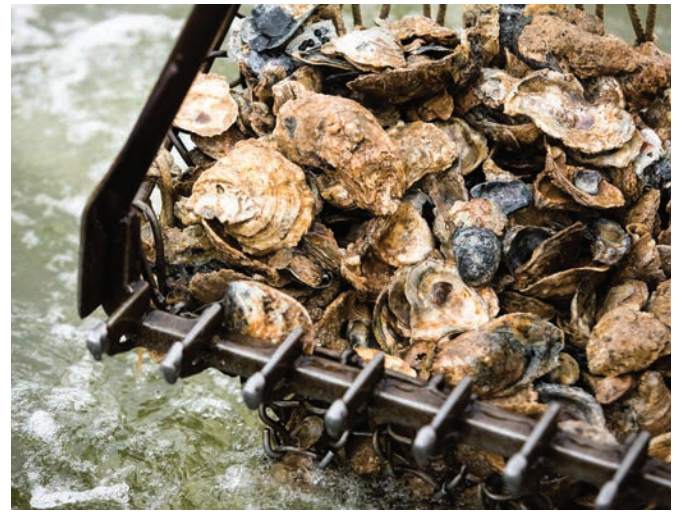
UMCES scientists helped assemble the first oyster stock assessment in Maryland waters in 135 years to help inform future management decisions for the fishery.